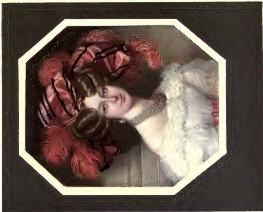
GRÄFIN SIDONIE POTOCKA—DE LIGNE BY EMANUEL PETER